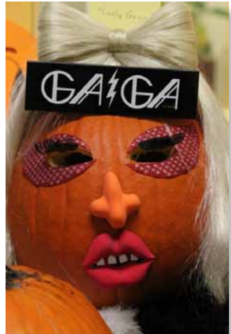
Lady Gaga wins the Grand Prize Pumpkin